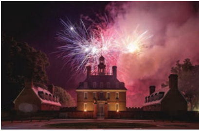
Colonial Williamsburg's Grand Illumination