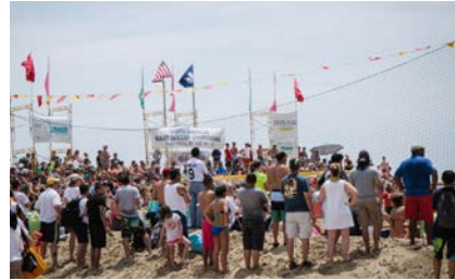
Virginia Beach North American Sand Soccer Tournament