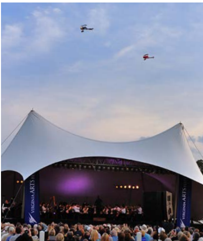
Smithfield Smithfield Wine Festival