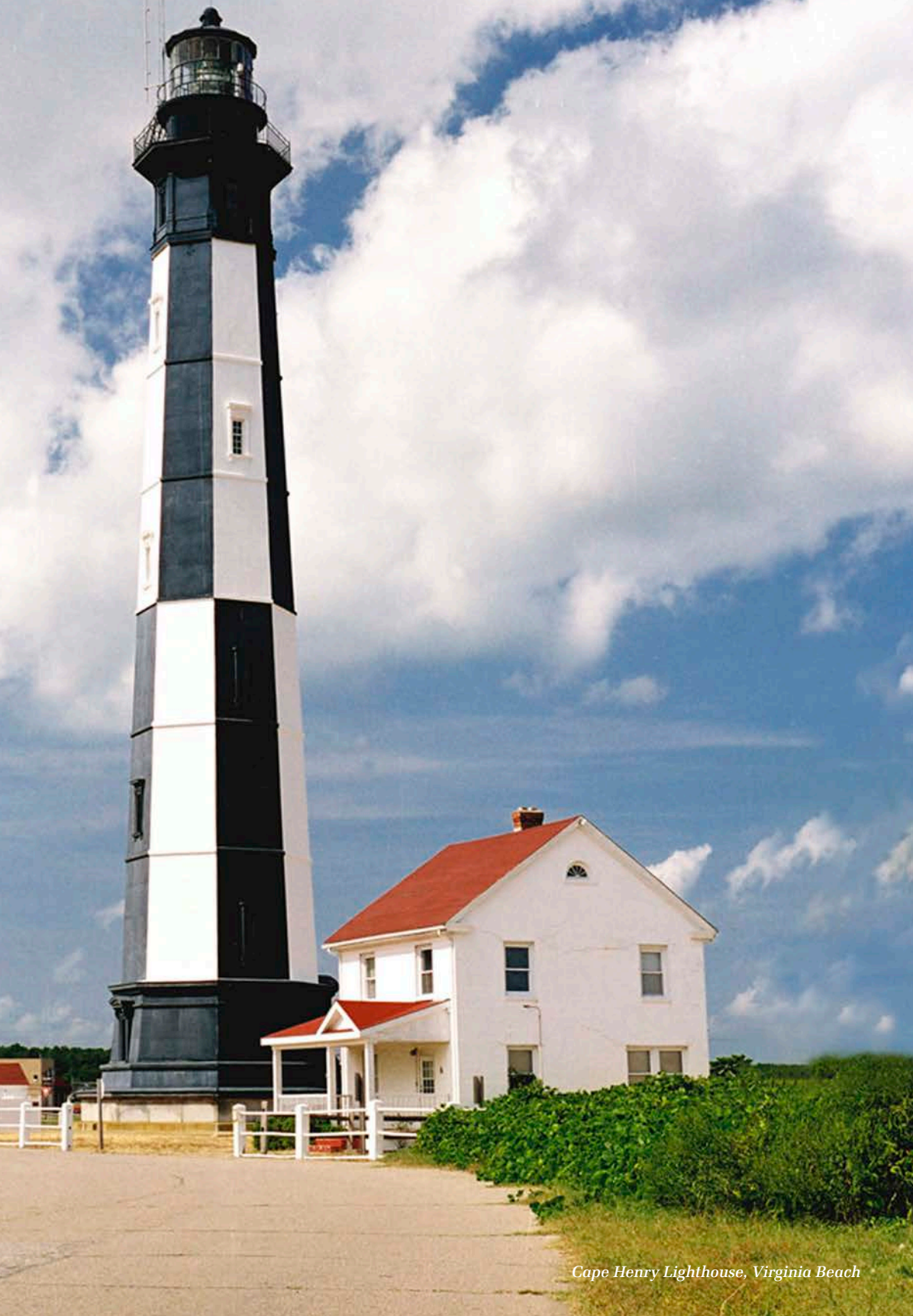
Cape Henry Lighthouse, Virginia Beach