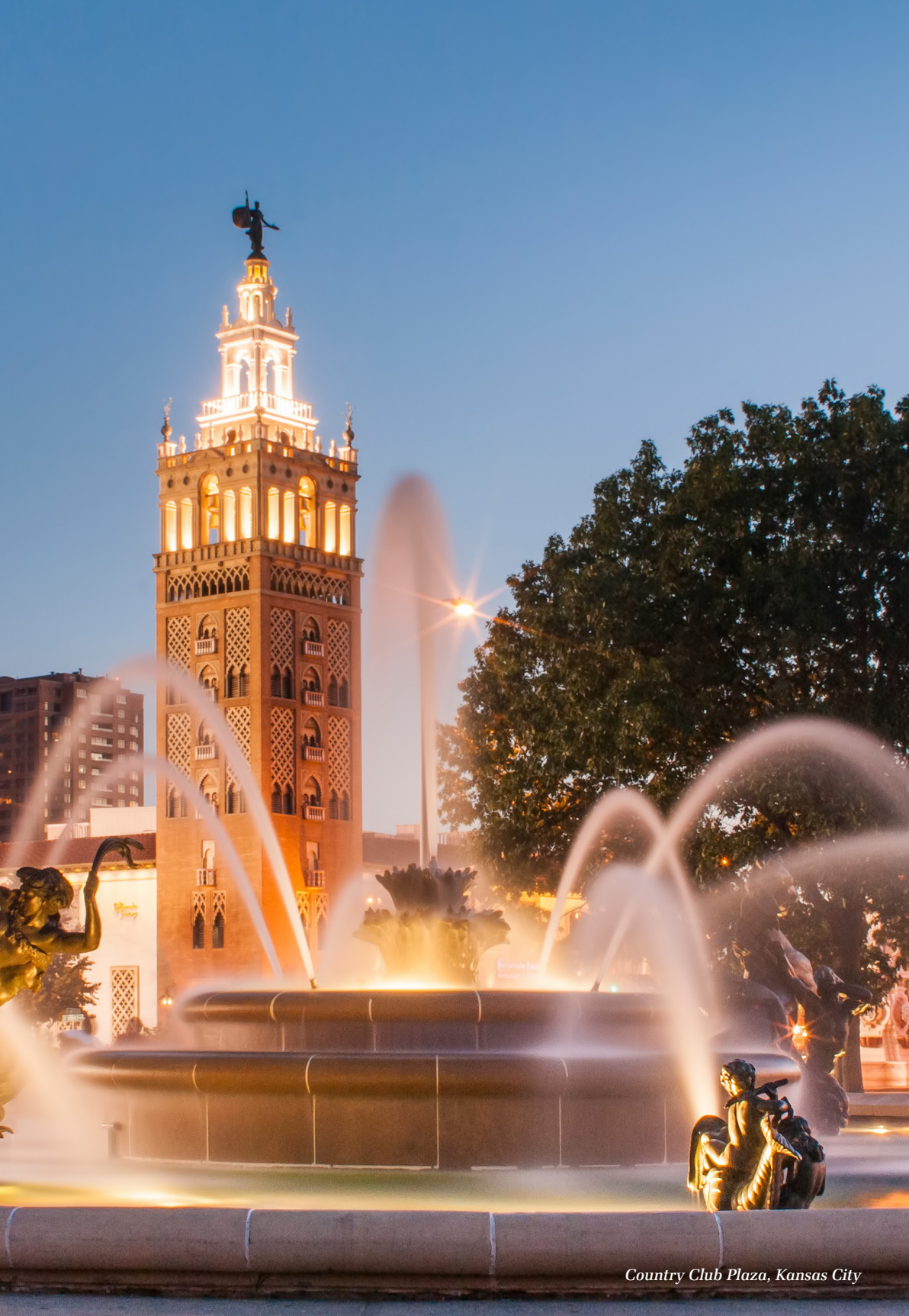
Country Club Plaza, Kansas City